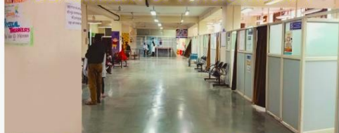
DEPARTMENT OF OCCUPATIONAL THERAPY