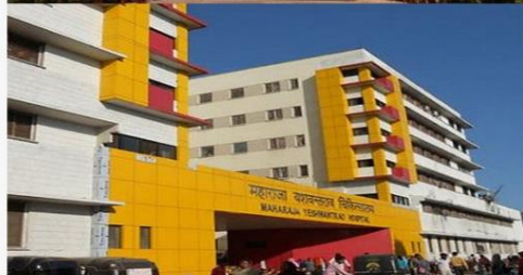
DEPARTMENT OF PHYSIOTHERAPY