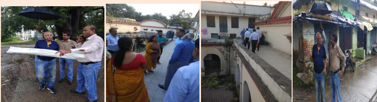
Old Nursing Building